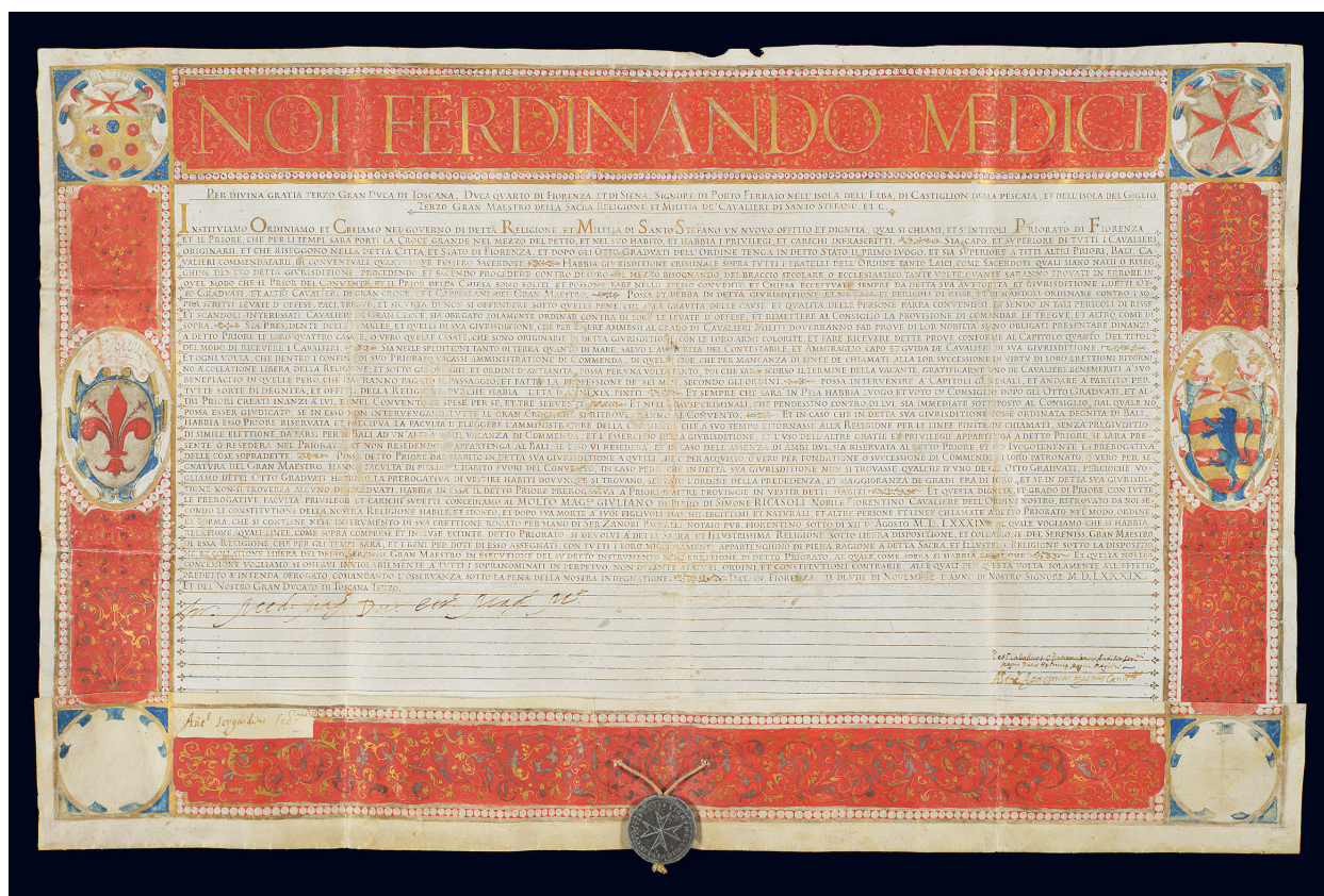
Above: Privilege of Ferdinando I, Grand-Duke of Tuscany, concerning the foundation of the Priory of Florence of the Sacro militare ordine di Santo Stefano papa e martire, 1589 November 8. HMML Project number HMML 00452.